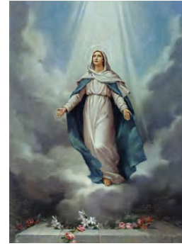
The Glorious Mystery of The Assumption

Pope Francis, in his book The Name of God is Mercy , writes that “the family is the first school for children, it is the unwavering reference point for the young, it is there that we have been loved and learn to love, have been forgiven and learn to forgive.” As parents our role is to teach with love, to raise up children of faith and to teach the ways of mercy. Parents allow, elicit, or maintain behaviours by their response to their children’s actions. A child’s future ability to thrive depends on parents taking the time to create habits and behaviours that will lead to success. Schools of love provide support, love and discipline to help their children grow.